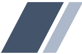
Figure 3: Safety Risk Management Process