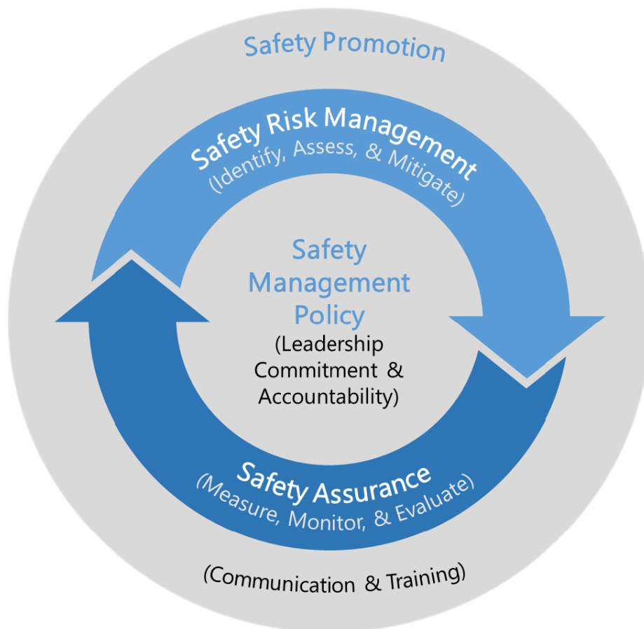
Figure 2: Safety Management Systems

Implementing SMS at TPPTS will be a major focus over the next several years. This ASP is the first step to further developing a systematic approach to managing the agency’s risk in such a way as to comply with 49 CFR Part 673. TPPTS has already taken several steps to implement SMS, such as having an established risk assessment process, implementing a Crash Review Committee, and now developing this initial ASP and designating a CSO. During the first year of implementation, TPPTS will identify SMS roles and responsibilities and key stakeholder groups, identify key staff to support implementation, and ensure the identified staff receive SMS training. TPPTS will also develop a plan for implementing SMS, inform stakeholders about the ASP, and discuss our progress toward implementation with the Parish Council and our agency’s planning partners.